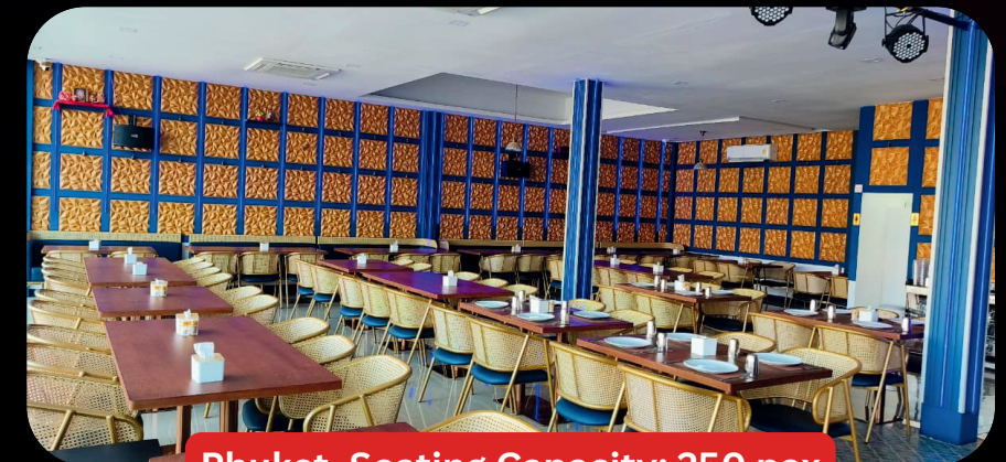
Phuket, Seating Capacity: 250 pax