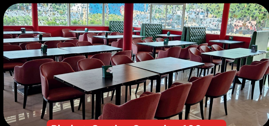
Phuket, Seating Capacity: 100 pax

ASOKA RESTAURANT is the result of AK Hospitality's continual quest to find innovative ways to serve our discerning clients, who expect the utmost quality and great value for money in the competitive food and entertainment industry. This 100 seater restaurant is a place to relax and indulge in our scrumptious variety of North and South Indian cuisine. Enjoy a delightful dining experience at Asoka Phuket, featuring a delectable menu prepared meticulously by our team of fully trained chefs