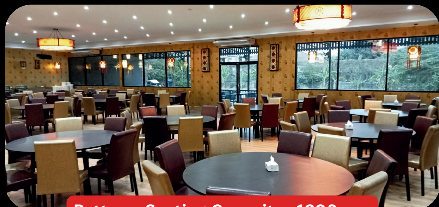
Pattaya, Seating Capacity: 1200 pax