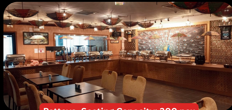
Pattaya, Seating Capacity: 300 pax